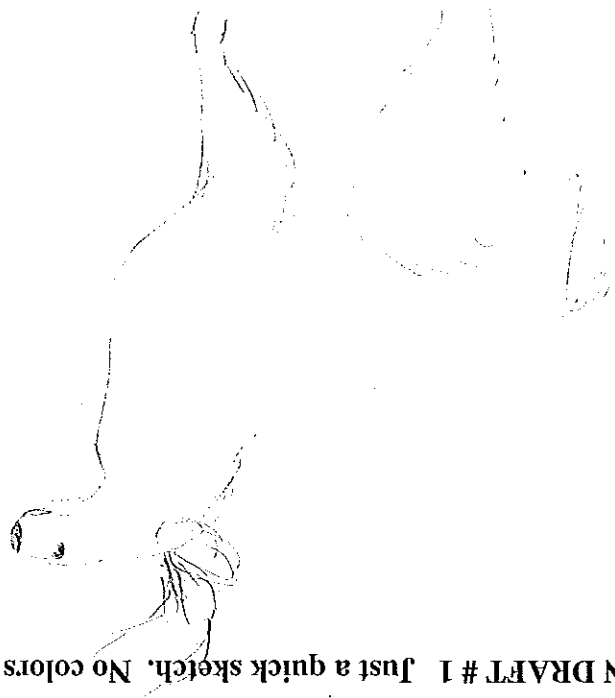
ICON DRAFT #1 Just a quick sketch. No colors.